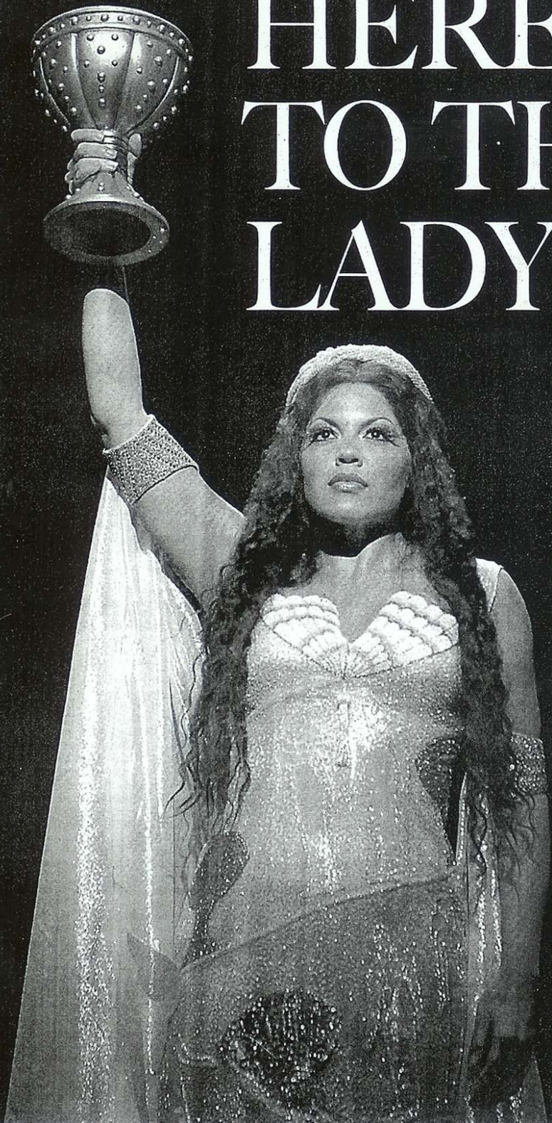
Sara Ramirez, who plays all the female leads in "Spamalot," had heard of Monty Python, but had never seen the movies. She rented them before her audition.

The versatile Sara Ramirez grabs her share of the spotlight in 'Spamalot'